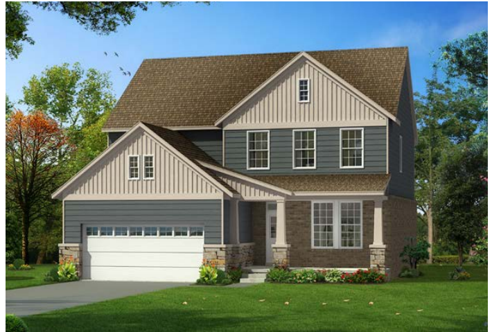
ELEVATION 2 ($289,990 + $5,150)