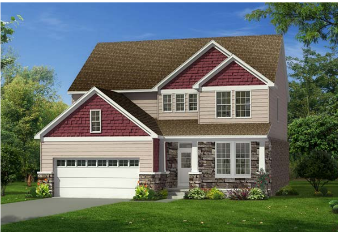
ELEVATION 3 ($289,990 + $7,970)