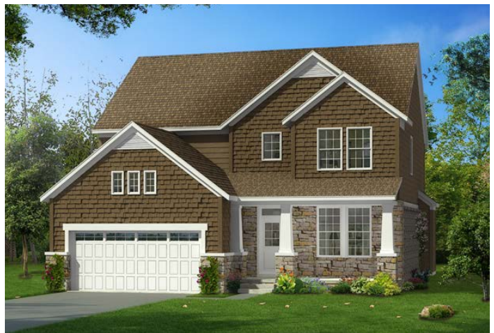
ELEVATION 4 ($289,990 + $9,130)

ELEVATION 5: Additional wrap around porch option ($289,990 + $14,900). ELEVATION 6: Added brick up to the windows on the garage ($289,990 + $10,280). Pricing as of 4-2-18 - subject to change without notice