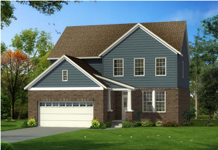
ELEVATION 1 ($289,990)

2,322 SF | 4 BEDROOMS | 2.5 BATHS | PRICED FROM $289,990