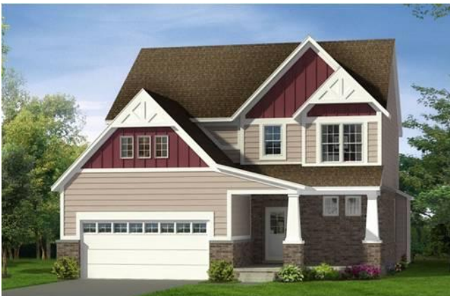
ELEVATION C: ($264,990 +$3,150)