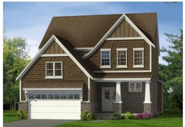
ELEVATION D: ($264,990 +$5,250)

Optional stone on front wall under porch ceiling available - see sales for additional pricing Pricing as of 3-16-18 - subject to change without notice