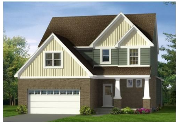
ELEVATION B: ($264,990 +$2,900)