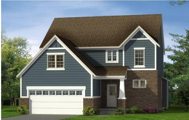
ELEVATION A: ($264,990)

1,815 SF | 3 BEDROOMS | 2.5 BATHS | PRICED FROM $264,990